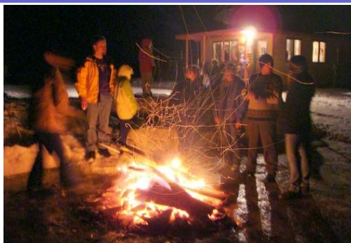
Bonfire fun at 2009 Candlelight Ski held at the Korkki Nordic Ski Center.

Programs funded by endowment dollars have long lasting impact and benefit NSCS students for years to come.